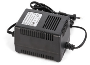
AC24V/3A Power Adapter