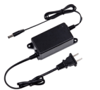
DH-PFM321D-US Power Adapter