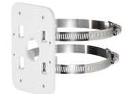
PFA152-E Pole Mount