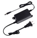
DH-PFM320D-US Power Adapter