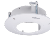
PFB200C In-ceiling Mount