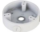
PFA137 Junction Box