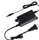
DH-PFM320D-US Power Adapter