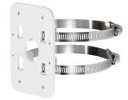
PFA152-E Pole Mount