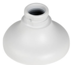
PFA106 Mount Adapter