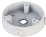
PFA139 Junction Box