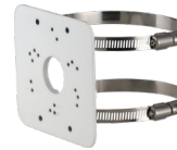
PFA152-E Pole Mount