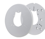
PFA200G Gang Box Adapter