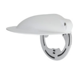
PFA200W Sun/Rain Shield