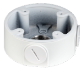
PFA13A-E Junction Box