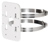
PFA152-E Pole Mount