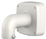
PFB302S Wall Mount