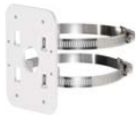
PFA152 Pole mount