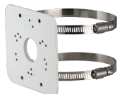
PFA152-E Pole Mount