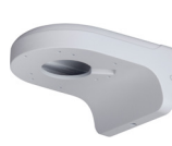
PFB203W Wall Mount