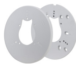
PFA200G Gang Box Adapter